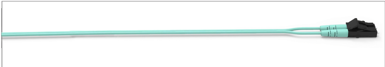
LC 2.0mm Duplex, 2F zipcord 2.0mm, 50µm OM3