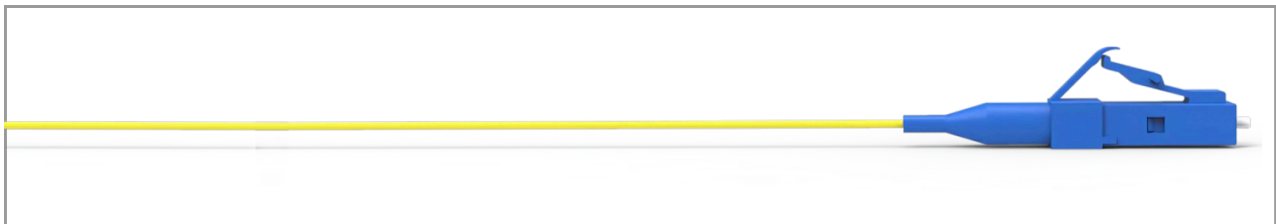
LC 900µm Simplex, OS2