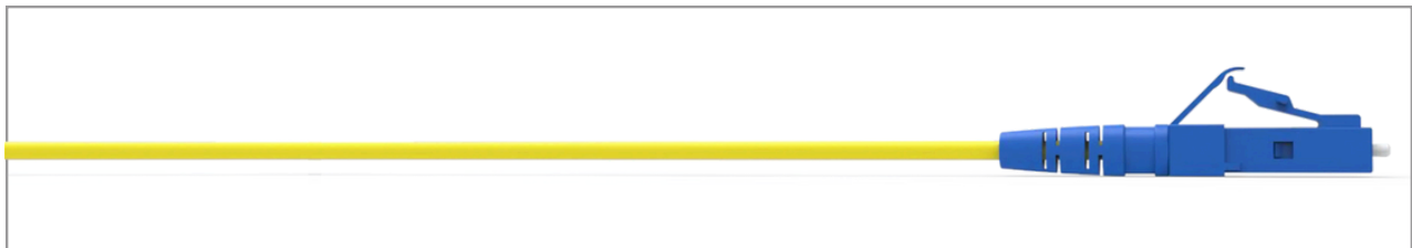
LC 2.0mm Simplex, OS2