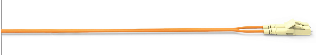
LC 2.0mm Duplex, 2F zipcord 2.0mm, 50µm OM2

*Available in any length and combination of connectors